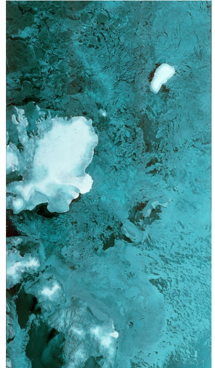
Austfonna ice cap – Sentinel-1B's first data captured at 05:37 GMT on 28 April 2016.

Find the application form here: https://sios-svalbard.org/RemoteSensing#CopernicusTraining2017